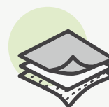
PU TPU PTFE Coating / Lamination