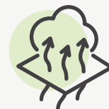
Water vapor permeability