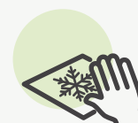
Cool to touch