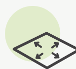
4 way stretch